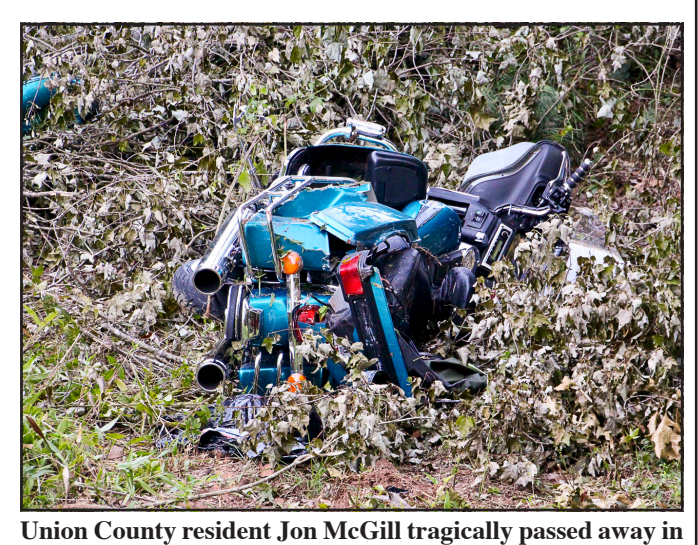
a motorcycle accident Saturday.