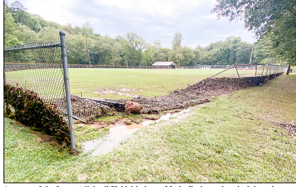
A corner of the fence at Colwell Field 1 in lower Meeks Park was knocked down by water and debris in last week's massive rainstorm.

Pertaining to the big sinkhole off Murphy Highway and GA 515, GDOT crews working on the scene have requested that local teachers please "stop sending students out to take pictures.