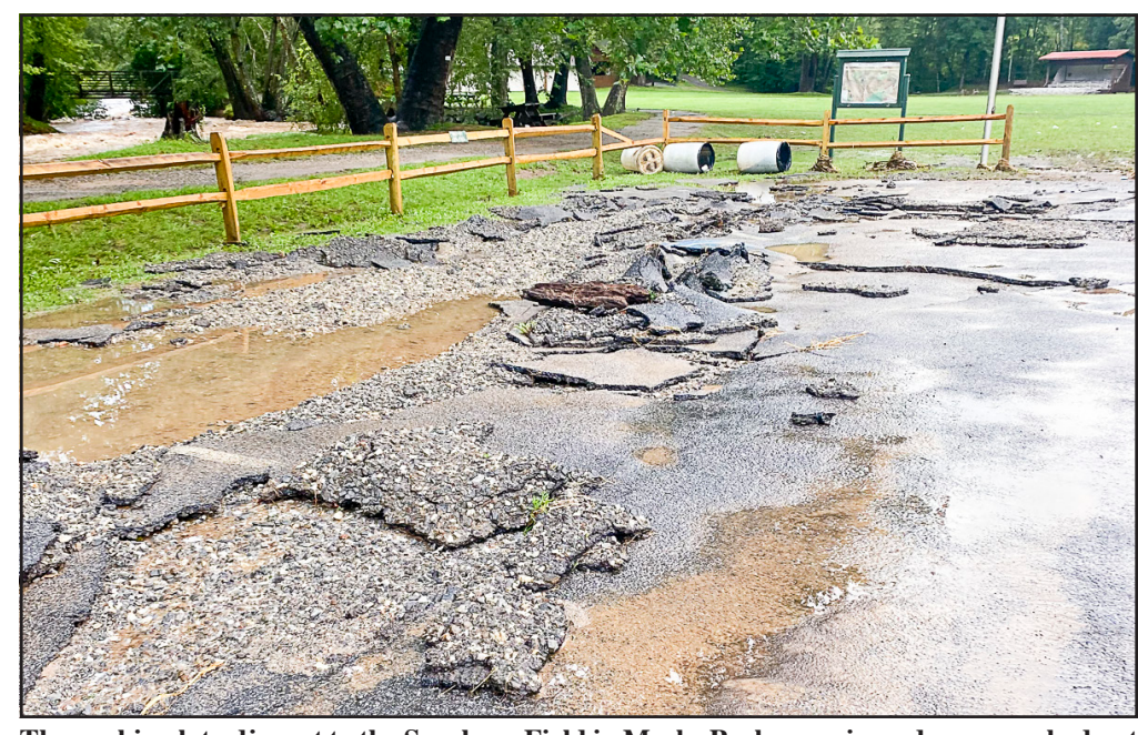
The parking lot adjacent to the Sorghum Field in Meeks Park experienced some washed out pavement due to the intense rain Aug. 29.