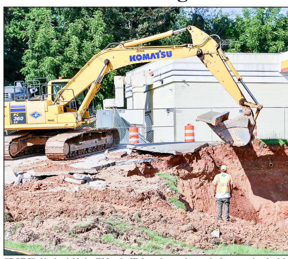
GDOT filled in the sinkhole off Murphy Highway in town last week after removing the drive leading up to the Shell station.

cannot have missed the work being done there to fix issues caused by a 40-foot-deep hole from dirt collapsing in the rain.