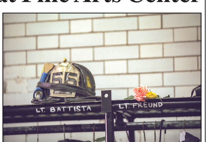
A helmet and flowers sit atop a rack at New York City's Engine Co. 55 firehouse in New York City.

It doesn't feel as though more than two decades have passed since the Sept. 11 attacks befell the nation, but this year, next Monday will mark the 22nd anniversary of the tragedy when, in 2001,