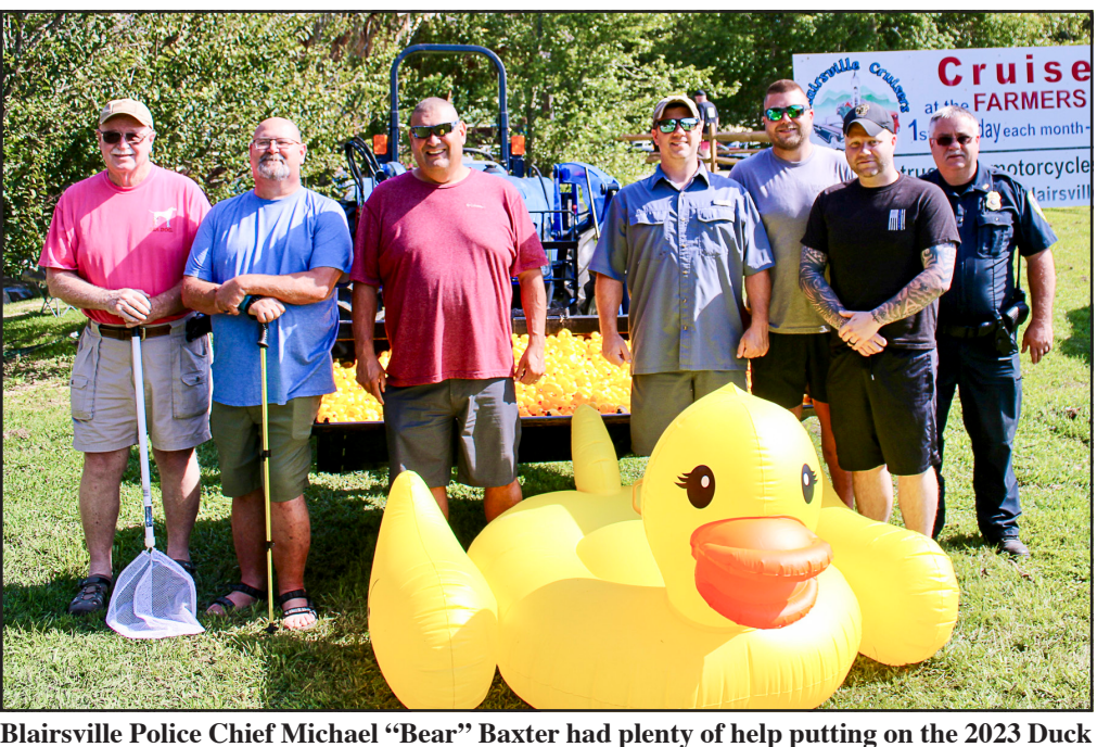
Derby that raised $30,000 for Shop With a Cop.