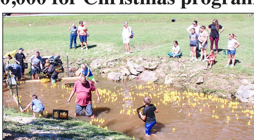
The Blairsville PD Duck Derby on Saturday was a huge success, bringing community members

And as is tradition, the last duck to finish the Butternut trek, lovingly dubbed the "Lame Duck," also won a prize, with the coveted gas grill See BPD Duck Derby, Page 3A